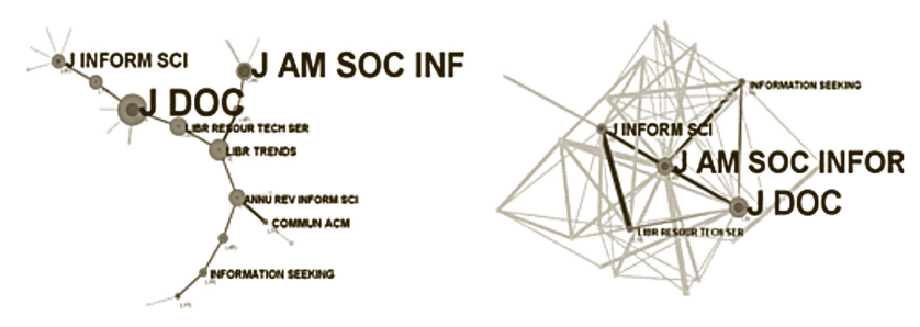
Fig. 4: Maps of social networks for co-cited journals (p. 11)

On completing this section, we observed the citation indices of the most consulted journals.